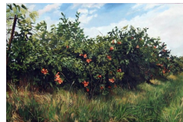
Exhibit Hours: September 16 & 17, 12- 4 pm

Enjoy a wonderful evening sampling a variety of perfectly paired wines with sumptuous appetizers surrounded by beautiful art from Fine Art Exhibit award winning artist Donald Schuster. After the tasting, enjoy a concert presentation from the Cincinnati Chamber Orchestra.