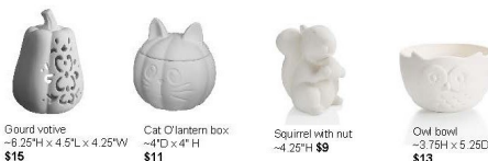
Gourd votive ~6.25"H x 4.5"L x 4.25"W $16 Cat O'lantern box ~4"D x 4"H $11 Squirrel with nut ~4.25"H $9 Owl bowl ~3.75"H x 5.25"D $13

Call the Recreation Center Front Desk to reserve your kit. DEADLINE TO ORDER IS OCTOBER 26! STARGLAZERS PAINTED POTTERY KIT